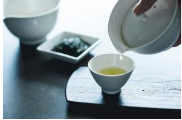
'TEA & BAR': Themed around a modern tea party